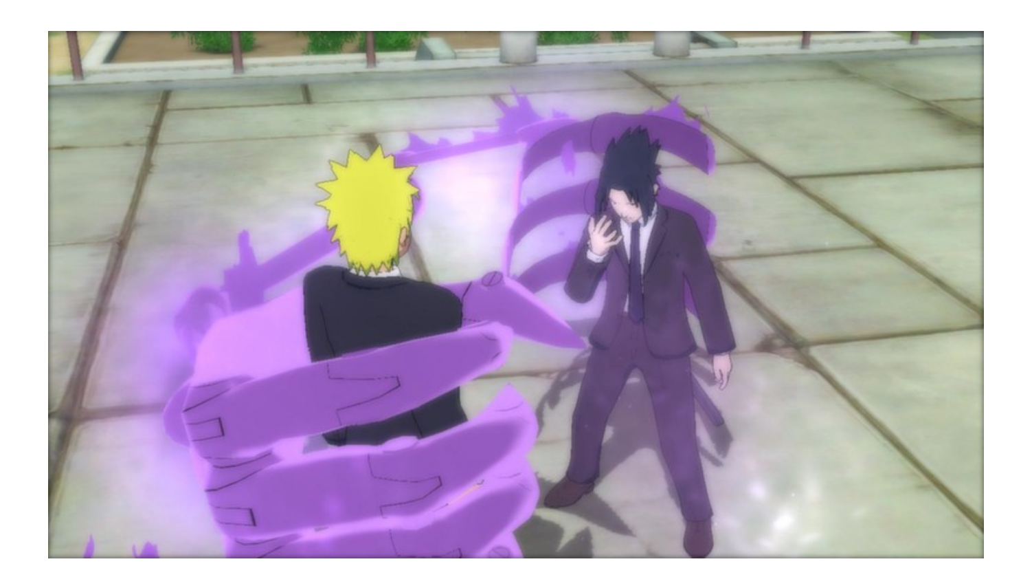
Download ->->-> <a href="http://bit.ly/2NJkW0t">http://bit.ly/2NJkW0t</a>

NARUTO SHIPPUDEN: Ultimate Ninja STORM Revolution - DLC6 Suit Pack Download For Pc [Crack Serial Key